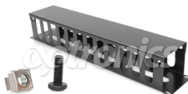
Horizontal cable Organizer