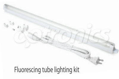
Fluorescing tube lighting kit