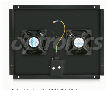
2 double fan kit, 120VCA 60Hz