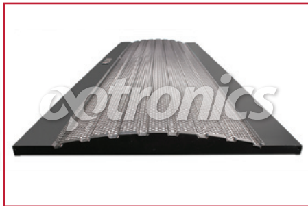
Steel mesh door